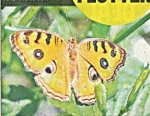
Family Nymphalidae | Peacock Pansy